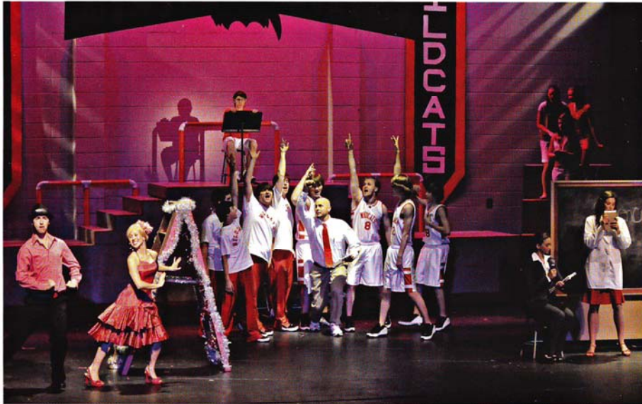
IN THE SPOTLIGHT: Ryan and Sharpay (left) audition for the high school musical while the Wildcat basketball team (center) plays a key game and Gabriella (right) competes in the science decathlon.